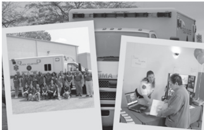
On May 14, Plaza Volunteer Rescue Squad participated in Senior Safety Day, which took place at the Police Benevolent Association building in Virginia Beach. Squad members showed off their truck, set up a table and gave away free safety information. Thanks to the Plaza Middle School students who planned and coordinated this very successful event.