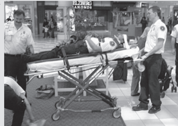
Rescue Squad Volunteers perform a lifesaving demonstration at Lynnhaven Mall in April

Emergency Medical Services Week unites local communities and medical personnel to publicize safety and honor the dedication of those who provide the day-to-day lifesaving services of the medical "front line." In celebration of National EMS Week 2005, members of several Virginia Beach Rescue squads came together at Lynnhaven Mall on April 23 for a safety demonstration. Many thanks to Plaza, Davis Corner and Princess Anne Courthouse Rescue Squads as well as the Dive Team and Search and Rescue Team for their participation.